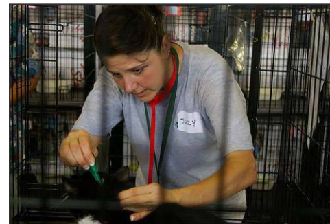
Hurricane Gustav, 2008.