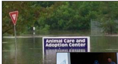
Iowa Floods, 2008.