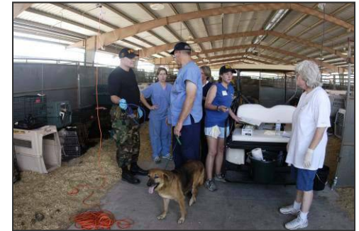
Hurricane Katrina, 2005.