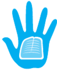
For children, ages 4 to 7 2 ounces