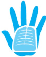
For an adult 4 ounces

Four ounces is about the size and thickness of an adult's palm.