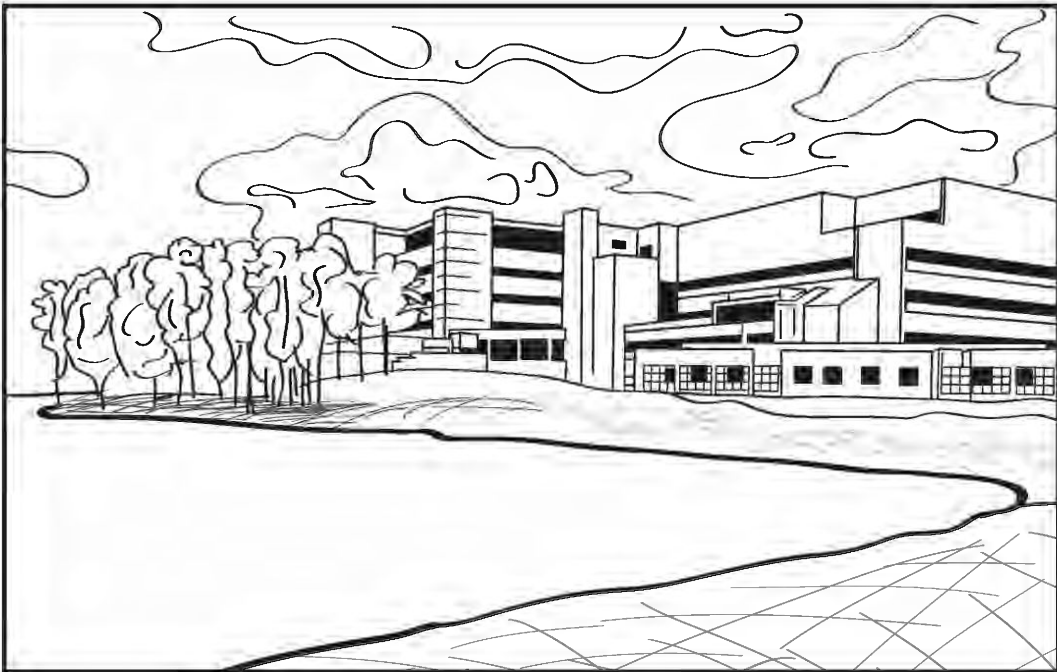
The National Institute of Environmental Health Sciences