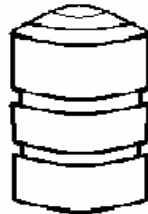
Round Nose Hollow Point Wadcutter