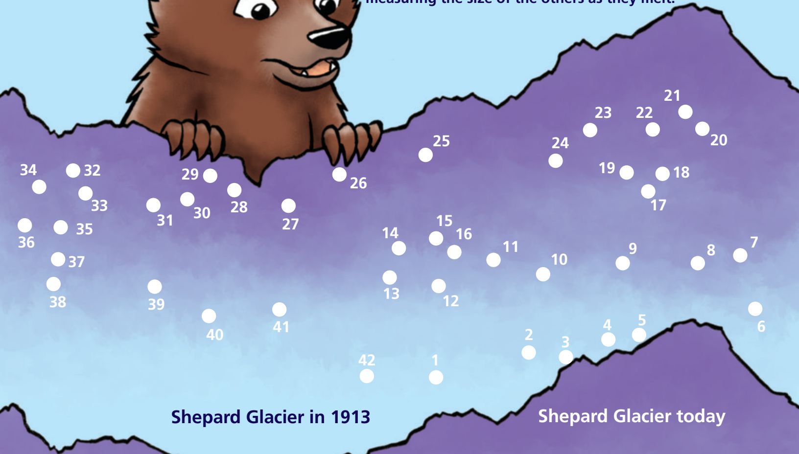
Shepard Glacier in 1913