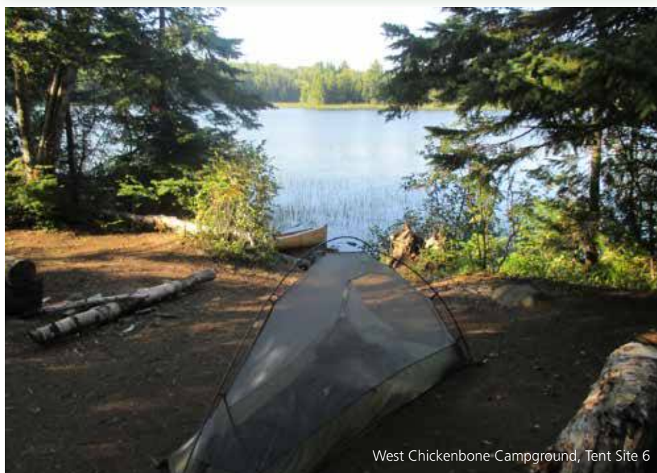
West Chickenbone Campground, Tent Site 6

Boat Rentals are available at Windigo and Rock Harbor. Contact Rock Harbor Lodge for more information (see page 10).