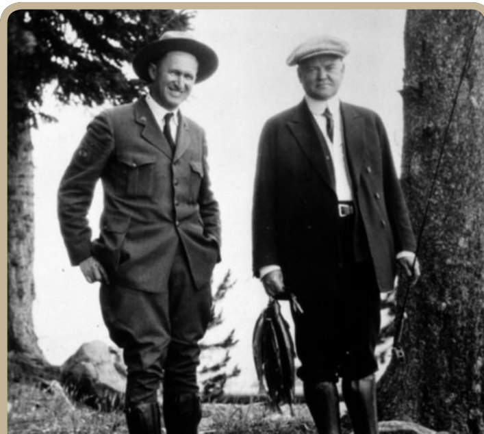
Herbert Hoover (on the right) with a Park Ranger in Yellowstone National Park.

While visiting Herbert Hoover National Historic Site, think about how these values helped him grow up to become a successful businessman, a world humanitarian, and a President of the United States.