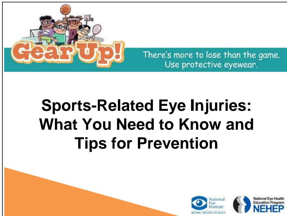
Title Page Slide