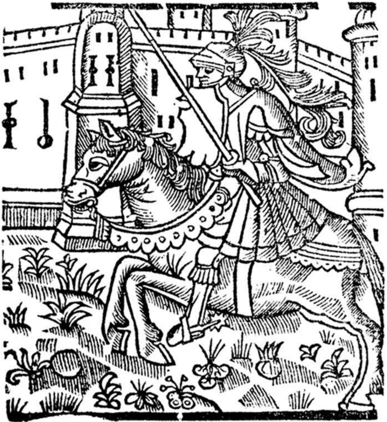
Image: Woodcut from The VVorkes of Our Ancient and Learned English Poet, Geffrey Chaucer, Newly Printed . 1602 (STC 5080 copy 1) We want to see your work on Twitter or Instagram! @FolgerLibrary #ColourourCollections