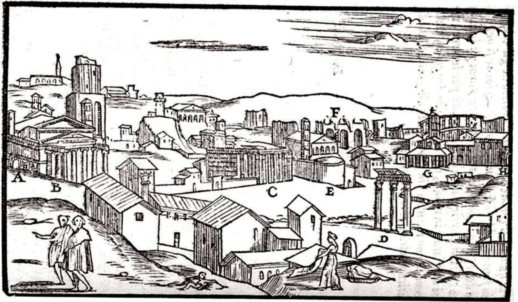
Image: Bernardo Gamucci, woodcut from Le Antichita della Citta di Roma... In Venegia: 1588 (179- 662q). We want to see your masterpiece! Share your work on Twitter or Instagram. @FolgerLibrary #ColourourCollections