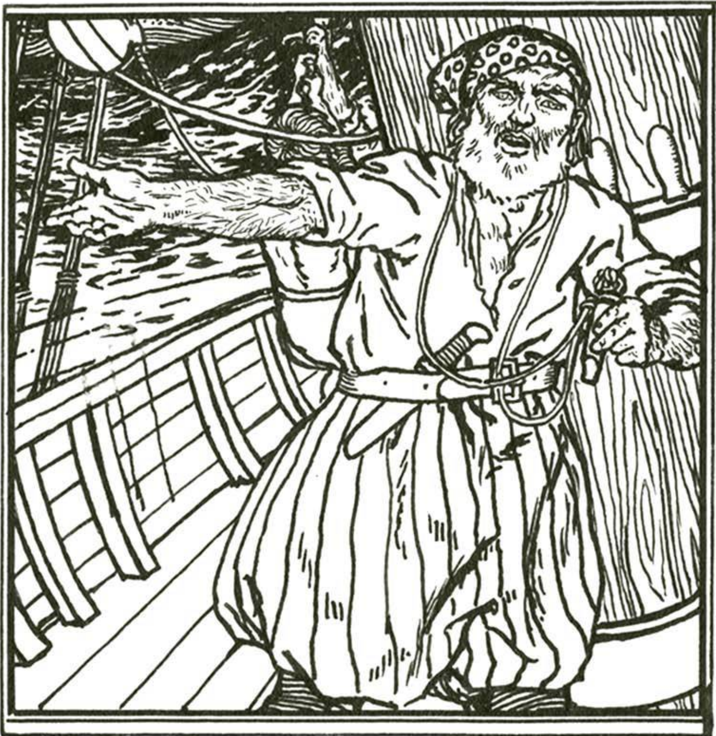
Image: Robert Anning Bell, pen & ink drawing for The Tempest: A Comedy . London: Freemantle & Co., 1901 (ART Box B433 no.11 (size S)) Share your work on Twitter and Instagram! @FolgerLibrary #ColourCollections