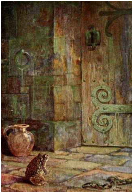
Toad was a helpless prisoner in the remotest dungeon

Then the brutal minions of the law fell upon the hapless Toad; loaded him with chains, and dragged him from the Court House, shrieking, praying, protesting; across the marketplace, where the playful populace, always as severe upon detected crime as they are sympathetic and helpful when one is merely "wanted," assailed him with jeers, carrots, and popular catch-words; past hooting school children, their innocent faces lit up with the pleasure they ever derive from the sight of a gentleman in difficulties; across the hollow-sounding drawbridge, below the spiky portcullis, under the frowning archway of the grim old castle, whose ancient towers soared high overhead; past guardrooms full of grinning soldiery off duty, past sentries who coughed in a horrid, sarcastic way, because that is as much as a sentry on his post dare do to show his contempt and abhorrence of crime; up time-worn winding stairs, past men-at-arms in casquet and corselet of steel, darting threatening looks through their vizards; across courtyards, where mastiffs strained at their leash and pawed the air to get at him; past ancient warders, their halberds leant against the wall, dozing over a pasty and a flagon of brown ale; on and on, past the rack-chamber and the thumbscrew-room, past the turning that led to the private scaffold, till they reached the door of the grimmest dungeon that lay in the heart of the innermost keep. There at last they paused,