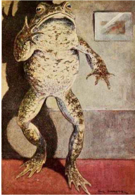
Dwelling chiefly on his own cleverness, and presence of mind in emergencies

admission you have been handcuffed, imprisoned, starved, chased, terrified out of your life, insulted, jeered at, and ignominiously flung into the water—by a woman, too! Where's the amusement in that? Where does the fun come in? And all because you must needs go and steal a motor-car. You know that you've never had anything but trouble from motor-cars from the moment you first set eyes on one. But if you will be mixed up with them—as you generally are, five minutes after you've started—why steal them? Be a cripple, if you think it's exciting; be a bankrupt, for a change, if you've set your mind on it: but why choose to be a convict? When are you