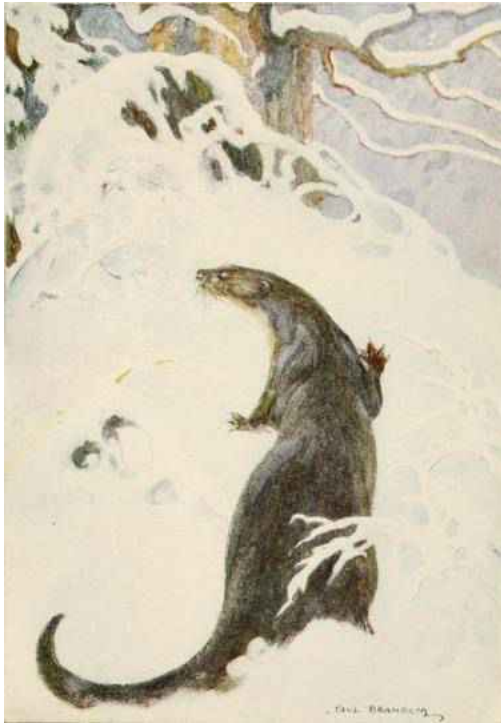
Through the Wild Wood and the snow

them in their perky conceited way, just as if they had done it themselves. A ragged string of wild geese passed overhead, high on the grey sky, and a few rooks whirled over the trees, inspected, and flapped off homewards with a disgusted expression; but I met no sensible being to ask the news of. About halfway across I came on a rabbit sitting on a stump, cleaning his silly face with his paws. He was a pretty scared animal when I crept up behind him and placed a heavy