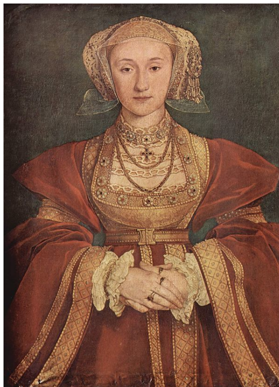
Henry was shown the above picture of Anne of Cleves.

Henry's only surviving son, Edward, was not a healthy child. Therefore, Henry wanted to marry again to ensure that a male could succeed him. Thomas Cromwell sug-