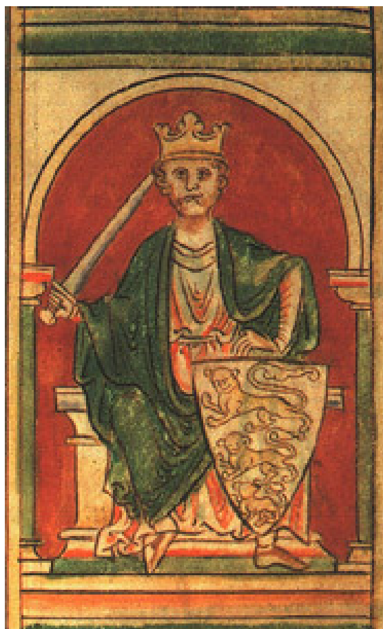
Richard the Lionheart

His father, Henry, made him Duke of Aquitaine in 1168, and of Poitiers in 1172. He therefore learned to defend