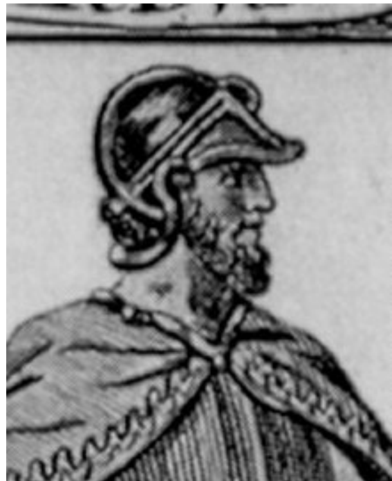
Artist's impression of Edward the Elder