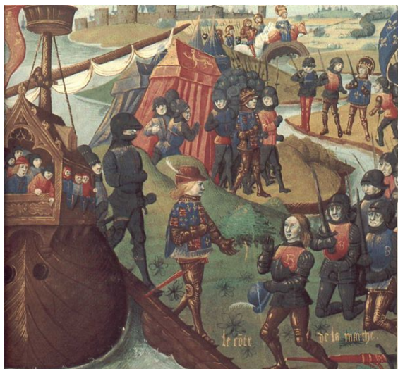
Henry III lands in Aquitaine, as shown in a 15th century from a later illumination.

Henry was extremely religious, and his journeys were often delayed by his insistence on hearing Mass several times a day. He was also much taken with the cult of the Anglo-Saxon King Edward the Confessor who had been made a saint in 1161. Told that St Edward dressed austere, Henry did the same and wore only the simplest of robes. He had a mural of the saint painted in his bedchamber for inspiration before and after sleep, and named his eldest son after him. Henry designated Westminster, where St Edward had founded the abbey, as the fixed seat of power in England. Westminster Hall duly became the greatest ceremonial space of the kingdom, where the council of nobles also met. Henry appointed French architects to renovate Westminster Abbey in Gothic style, and work began at great expense in 1245. The centrepiece at the renovated Abbey was a shrine to Edward.