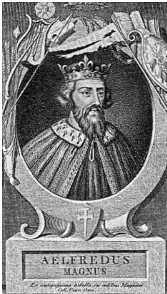
King Alfred the Great

Alfred the Great was born around 850 in Wantage, in what is now Oxfordshire. Alfred was the fourth son of King Ethelwulf of Wessex. He became king of the southern Anglo-Saxon kingdom of Wessex in 871, when his