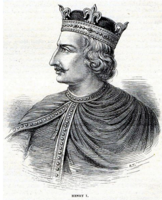
Henry I depicted in Cassell's History of England (1902)

In 1101, a year after Henry became king, his older brother, Robert, invaded England in an attempt to become king. They agreed a peace in the Treaty of Alton, in which Robert accepted Henry as King of England and returned peacefully to Normandy. In return Henry agreed to pay Robert 2000 marks each year. Four years later, though, Henry took an army across the English Channel. In 1106, he defeated his brother's Norman army decisively at Battle of Tinchebray. He imprisoned his brother Robert, and claimed the Duchy of Normandy as a possession of England, as a result reuniting his father's lands.