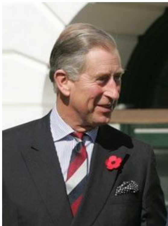
Prince Charles, the Prince of Wales

Prince Charles, who was born at Buckingham Palace on 14 November 1948, is the eldest son of Elizabeth II and Prince Philip, Duke of Edinburgh. He is the heir to the throne of the United Kingdom. The Prince of Wales is well known for his extensive charity work, particularly for the Prince's Trust. He also carries out a full schedule of royal duties, and increasingly is taking on more royal roles from his aging mother. The Prince is also well known for his high profile marriages to the late Lady Diana Spencer and subsequently to Camilla, The Duchess of Cornwall.