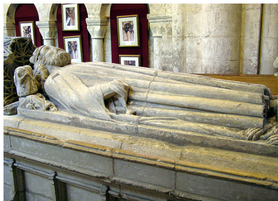
The tomb of King Athelstan in Malmesbury Abbey. There is nothing in the tomb beneath the statue, the relics of the king having been lost in the Dissolution of the Monasteries in 1539.

Athelstan was born around the year 895 and became king, first of Mercia, in 924 and then of Wessex in 925. He was the son of King Edward the Elder. Political alliances were high on Athelstan's agenda. A year after becoming king, he had a sister married to Sihtric, the Viking King of York. Sihtric died a year later, and Athelstan took the chance to capture Northumbria. This was a bold move, and made him the king of a larger territory than any Anglo-Saxon king before him, roughly equivalent to modern England, except for Cornwall. The rulers of the territories neighbouring Athelstan's then appear to have submitted to him at Bamburgh. The Anglo-Saxon Chronicle noted that these included "Hywel, King of the West Welsh [that is, the Cornish], and Constantine II, King of Scots, and Owain, King of the people of Gwent,