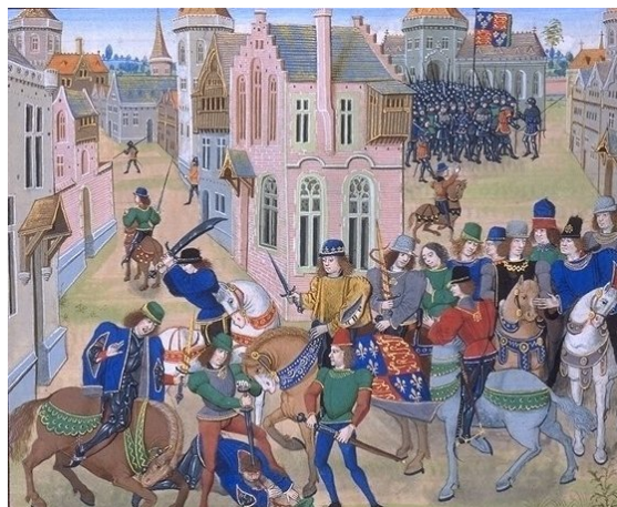
Richard II watches Wat Tyler's death and addresses the peasants in the background

John of Gaunt, his uncle, ruled on Richard's behalf for the first years of his reign and it was the Peasants' Revolt of 1381 that brought Richard into the limelight. It fell to him personally to negotiate with Wat Tyler and the