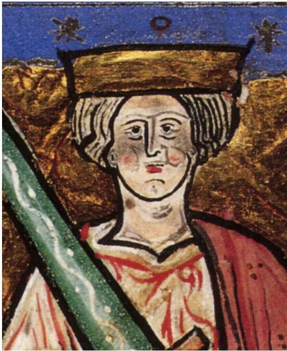
Ethelred the Unready

Ethelred the Unready was born around the year 968 in Wessex and died in 1016. He was King of England between 978 and 1013, and then again between 1014 and 1016. He is also known as King Ethelred II. His nickname “The Unready” does not mean that he was ill-prepared, but comes from the Anglo-Saxon unræd meaning “without counsel” or “indecisive”. This could also be interpreted as a pun on his name, Æðelræd , which may be understood to mean “noble counsel”. Ethelred became king when he was aged about 10 after the death of his father, King Edgar, and the murder of his half-brother King Edward.