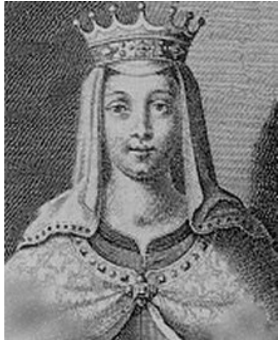
Empress Matilda (or Maud)

Empress Maud is the title by which Matilda , the only daughter and second child of King Henry I of England,