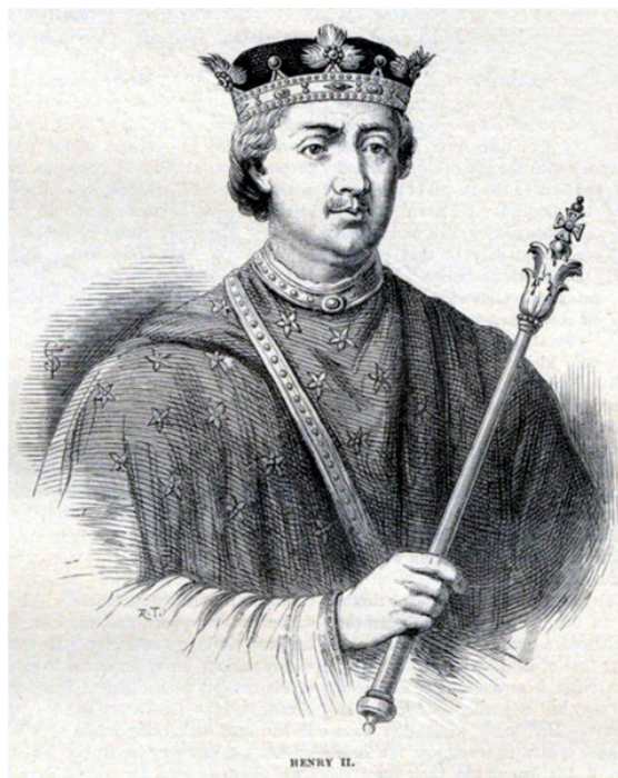
King Henry II

Henry II was born on 5 March 1133 in Le Mans. He ruled as Count of Anjou, Duke of Normandy and as King of England from 1154 until his death in 1189. Following the disputed reign of King Stephen, Henry's reign saw efficient consolidation. Henry II has a reputation as one of England's greatest medieval kings. At various times he controlled parts of Wales, Scotland, eastern Ireland, and western France. He was the first of the Plantagenet or Angevin Kings. Before becoming king Henry already controlled Normandy and Anjou. Whilst king, he had an empire, known as the Angevin Empire, that stretched from the Solway Firth almost to the Mediterranean and from the Somme to the Pyrenees. His mother was Empress Matilda, and his father was her second husband, Geoffrey of Anjou. He was brought up in Anjou, which is where the name Angevin comes from, though he visited England in 1149 to help his mother with her claim to the English throne.