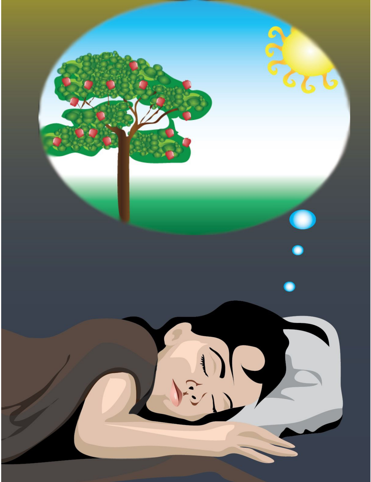
one night, while Wiseheart slept, he dreamed of the beautiful, Sun-filled world